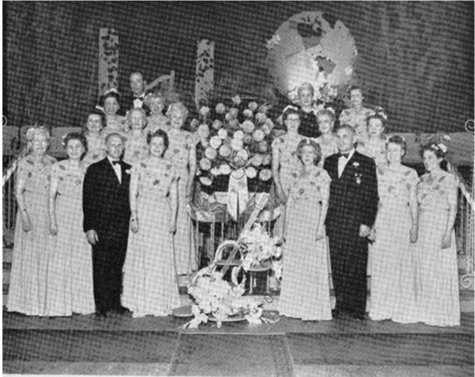
Grand Officers, 60th Annual Session, Sept. 26, 27 and 28, 1950