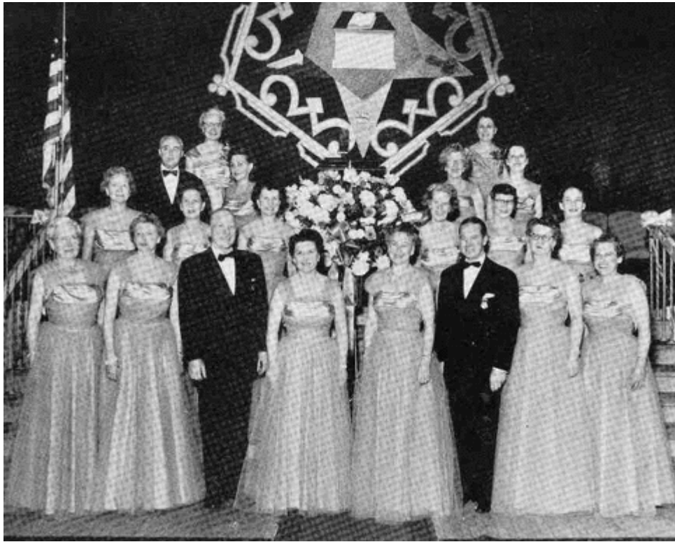
1953 Grand Family