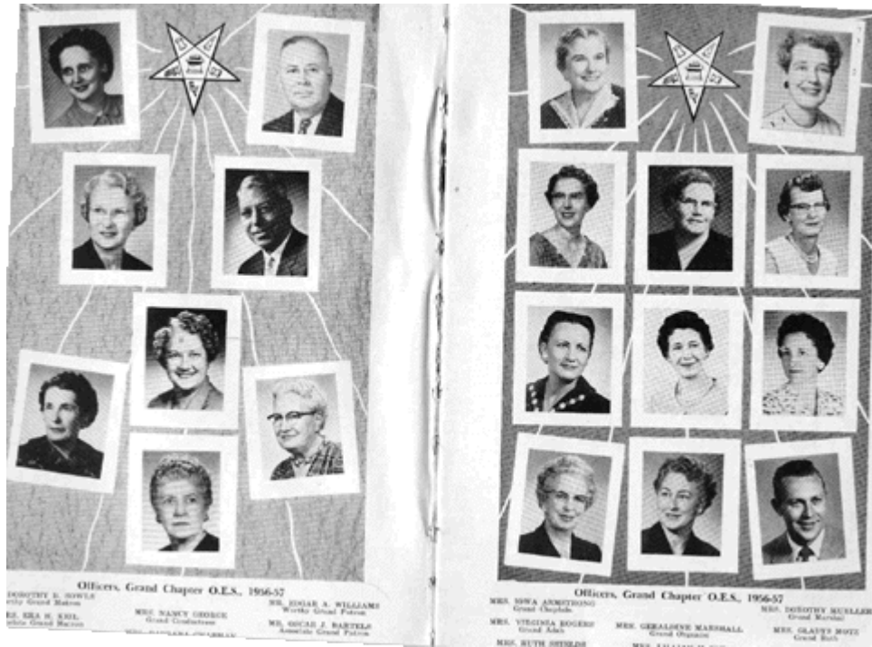
1957 Grand Family