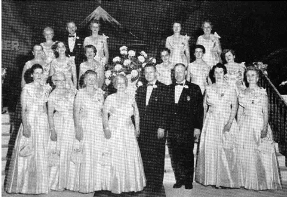
1959 Grand Family