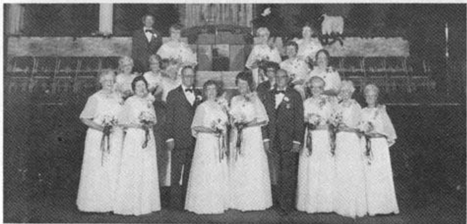
GRAND OFFICERS 91st SESSION — May 18, 19, 20, 1982