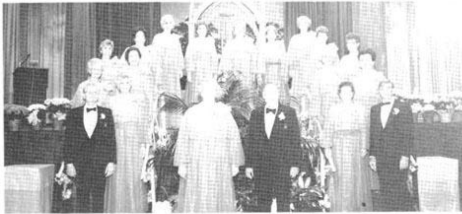
GRAND OFFICERS 94TH SESSION — May 21, 22, 23, 1985