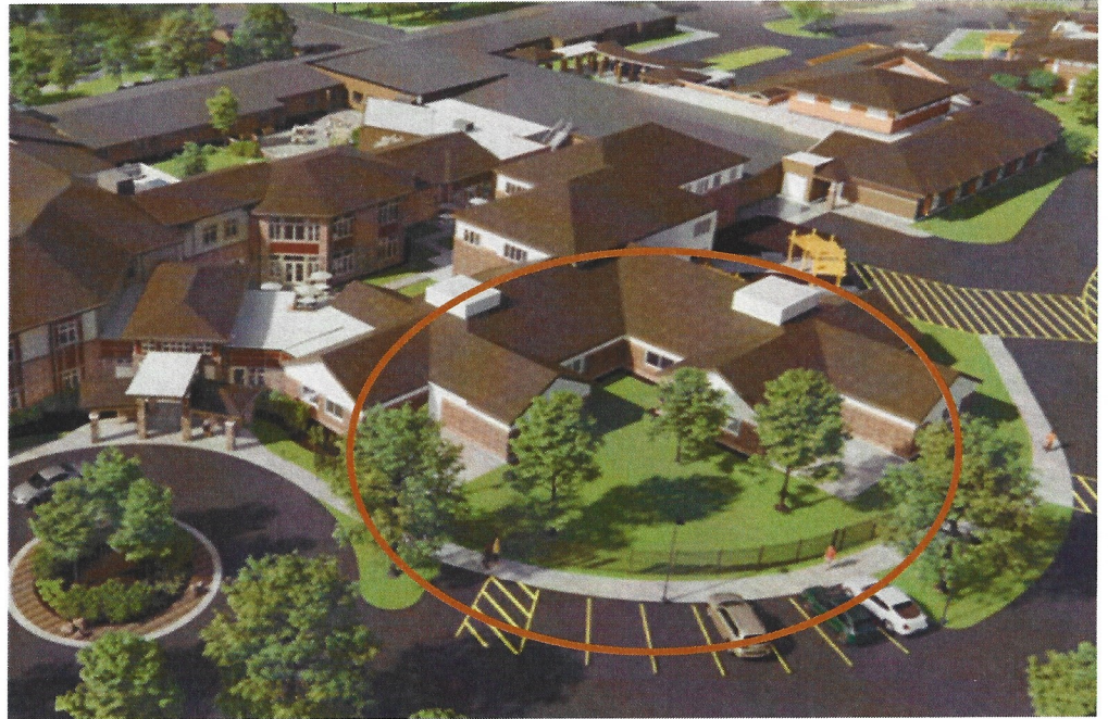
Rendering of current Riverside Lodge Memory Care courtyard.

ANTICIPATED PROJECTS COSTS: $16,000 - $20,000