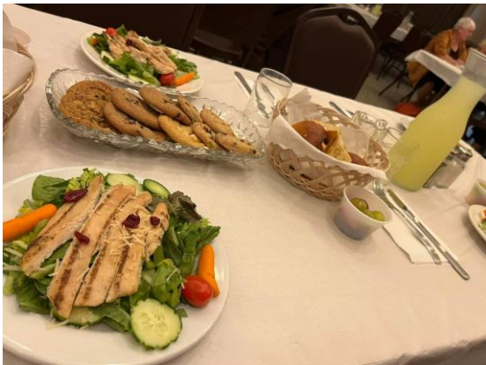
Grilled Chicken Salad, Yum!