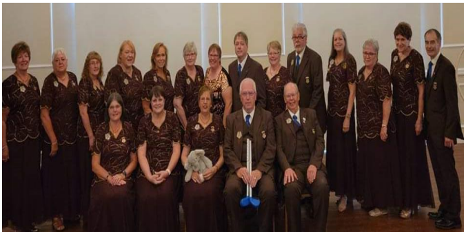
2023-2024 Grand Officers