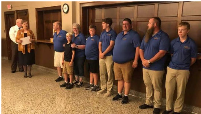
Chippewa Valley DeMolay