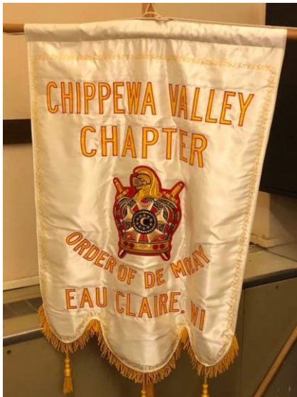
Chippewa Valley DeMolay Served us a Wonderful lunch