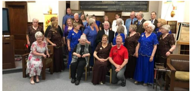
Alpha, Argyle Initiation