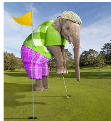
Deb and LeRoy

Summer means happy times and good sunshine – enjoy them both until we meet again.