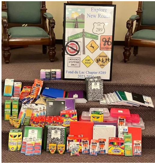
Fond du Lac Chapter collected School Supplies for the Fond du Lac Boys and Girls Club.