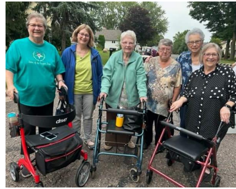
Members of Willow River Chapter, New Richmond spending the evening in Clear Lake listening to a bell choir and barber shop music.