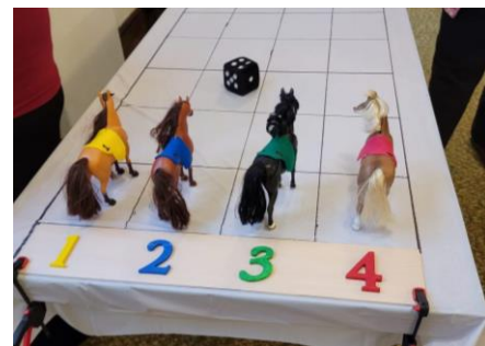
Off to the races!