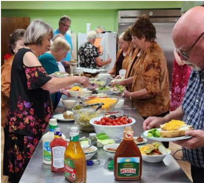
Baked Potato Bar