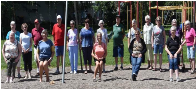
Northwest Club Picnic