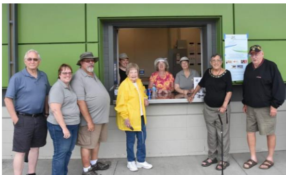
West Allis Chapter working a Brat Stand