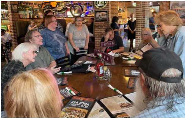
Loyalty Chapter, Plymouth enjoying their Monday dinner out.