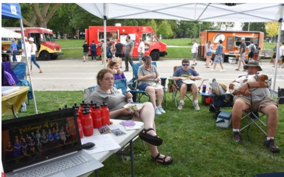
Vega Chapter Membership Tent at Chill on the hill.