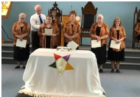
Grand Star Points