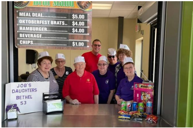
Wauwatosa Chapter helped Bethel #3 work a Brat Stand at Festival Goods