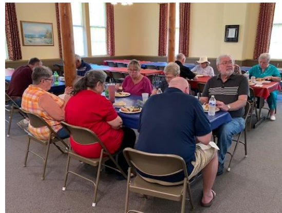
Union Grove Masonic Bodies Picnic