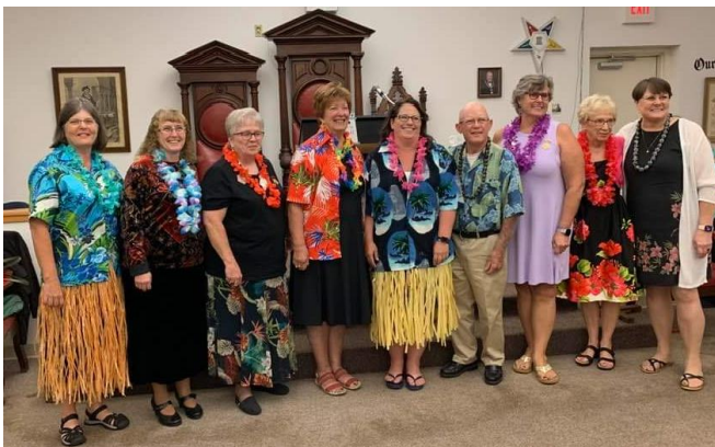
Grand Officers and Escorts at Hawaiian Night at Starlight Chapter, Madison