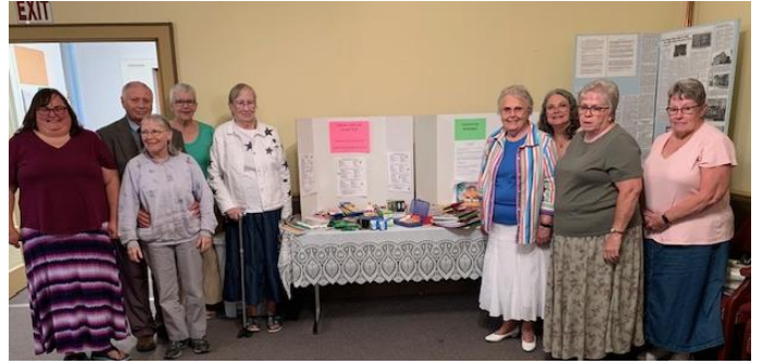
During the months of July and August Union Grove Chapter collected school supplies for the Union Grove Elementary School. Pictured are the Union Grove members with the supplies.