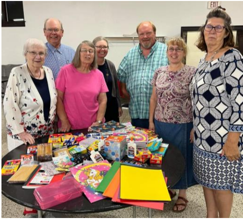
Dodgeville Chapter collected School Supplies for area schools.