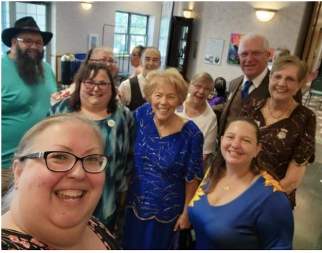
Former Jobie's who are now OES members at Jobie Jamboree at Green Lake.