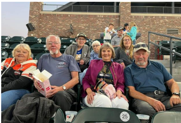
Members of Janesville Chapter attended a Beloit Sky Carp Minor League Baseball Game