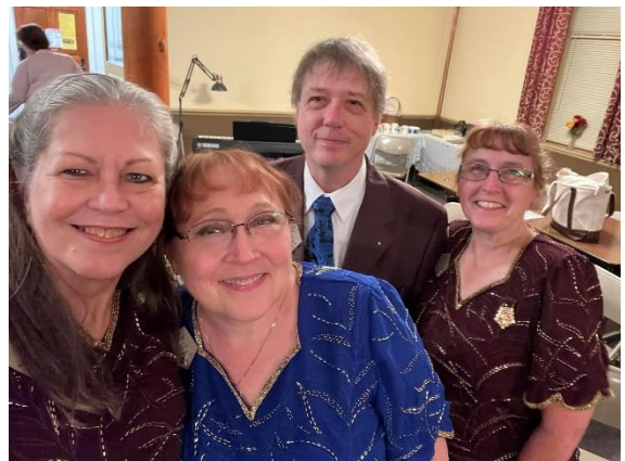
Grand Officers and Escort