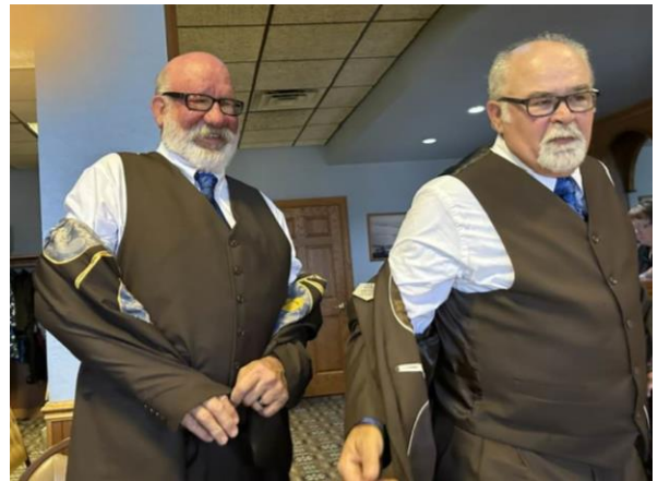
The men were told they could take their jackets off because it was very warm in the room.