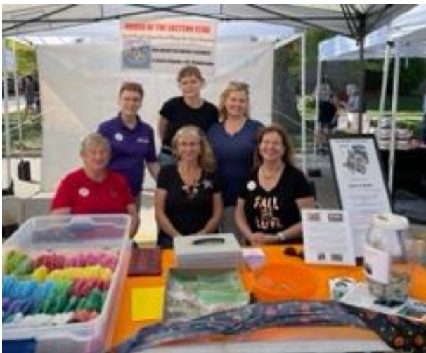
LaBelle Chapter, Mukwonago at Fall Fest.