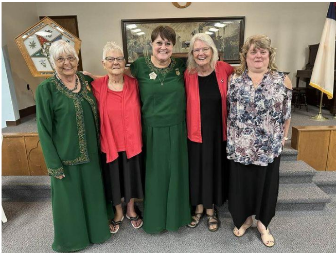
Golden Chain of Friendship mini reunion