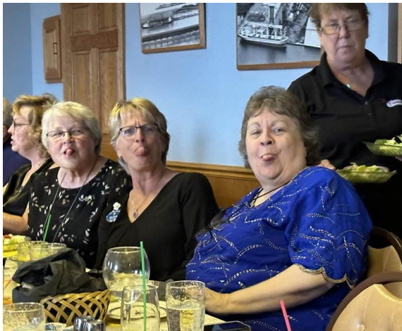
Poking fun at the camera.