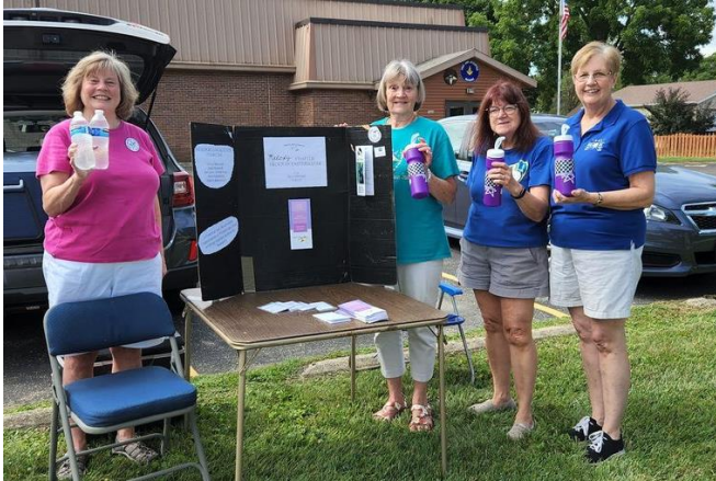
Members of Melody Chapter, Middleton providing water for the Good Neighbor Parade/Festival