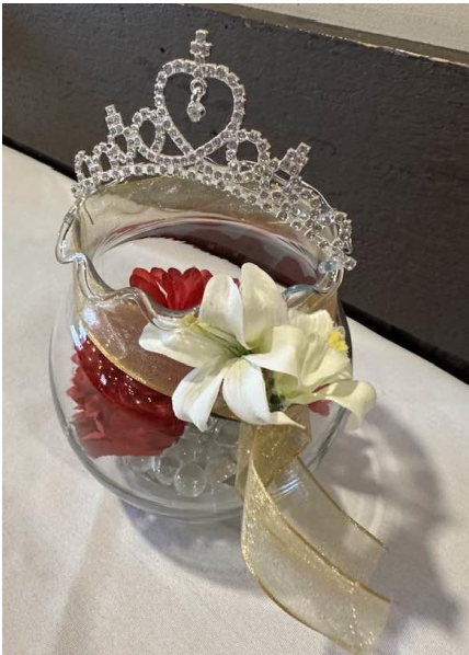
Grand Esther Decorations