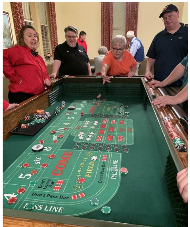
Casino Night at Union Grove