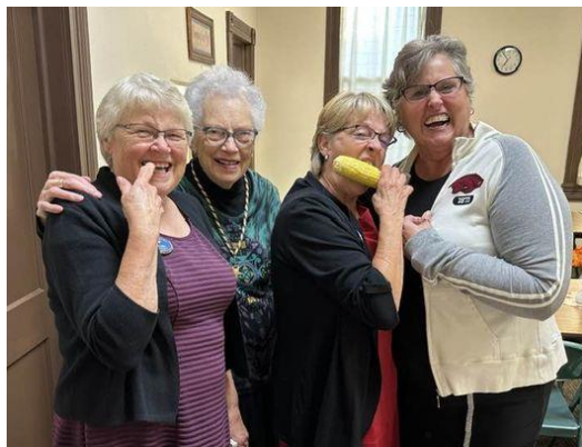
Members of Northwest Chapter pickin' and a grinnin'