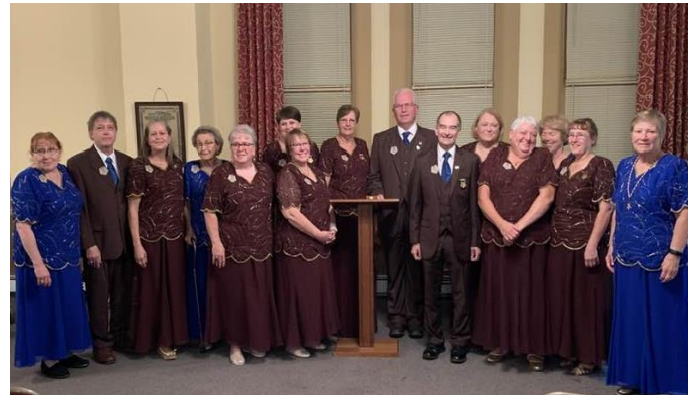
Have Faith in Your Dreams Grand Officers