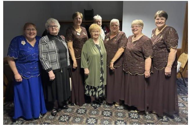
Former Grand Ruth's in Superior