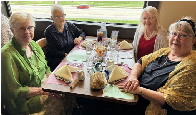
Viroqua and Sparta Members have a good time!