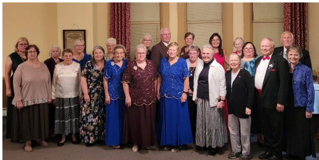
Members of Burlington Chapter and Union Grove Chapter after the consolidation.