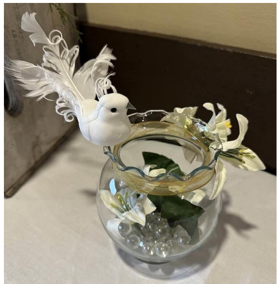
Grand Warder Decorations.