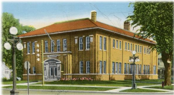
The Museum Building turns 100! Join the staff of both museums and representatives from the Sparta Masons and Eastern Star to hear about the history and past use of this local landmark listed on the National Register of Historic Places.