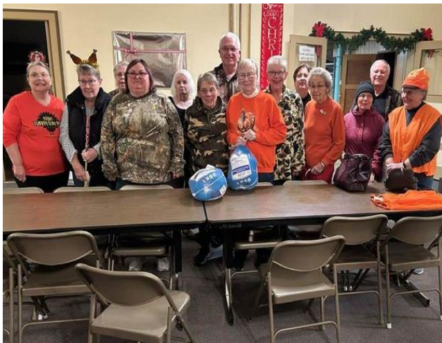
Union Grove Chapter has bagged 253 lbs of turkey for the turkey dinner in February