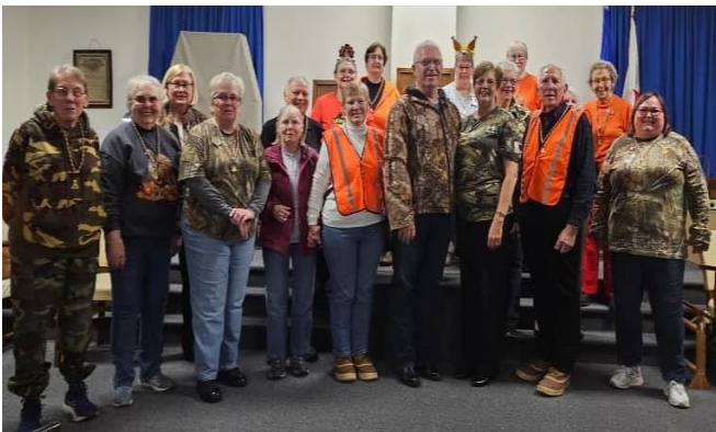
Worthy Grand Matron and Worthy Grand Patron visit to Union Grove Chapter