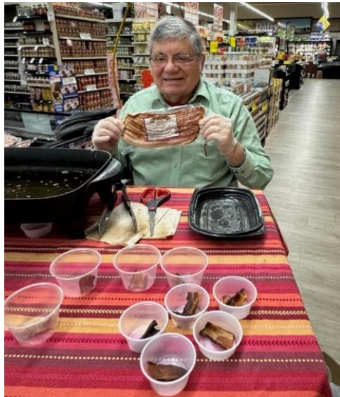
Ellsworth Chapter members had a great time serving up food samples at Nilssens Grocery for their annual Holiday Open House.