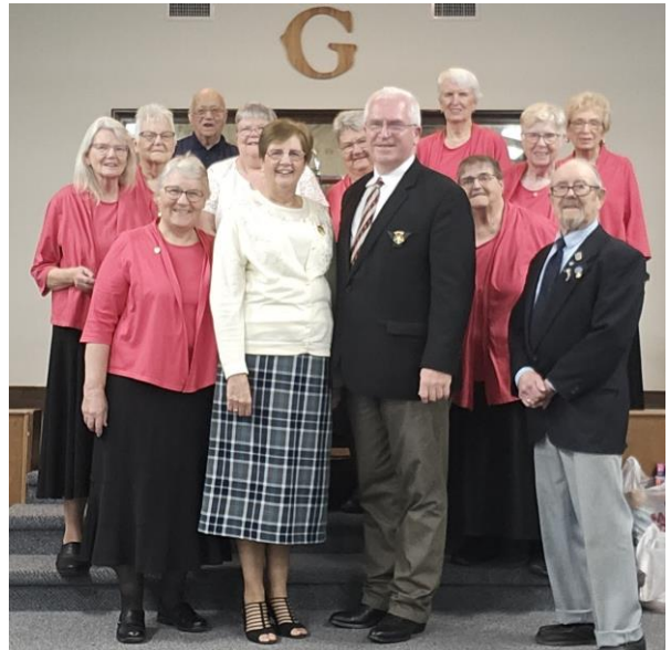
Worthy Grand Matron/Worthy Grand Patron visit to Sparta Chapter on November 20 th