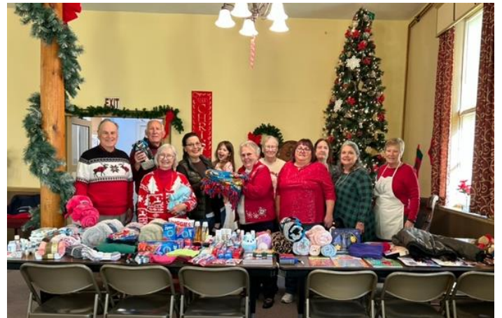
The Southeast Club collected items for the Racine County Foster Care program.