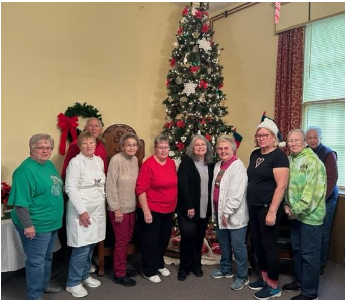
Union Grove Chapter decorated the hall at the Union Grove Masonic Center