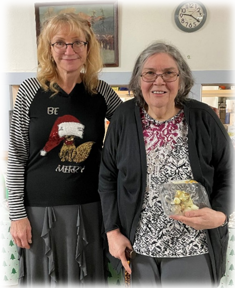
Lefse demonstration at Martha Chapter! Krumkaka made as well! Norwegian family history was fun to share. The best part was eating!!