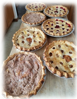
Vega Chapter honored Masons with Beef Stew, salad, pies & Tin auction for Vesta-a-Dogs. They raised $347 and received 2 petitions.