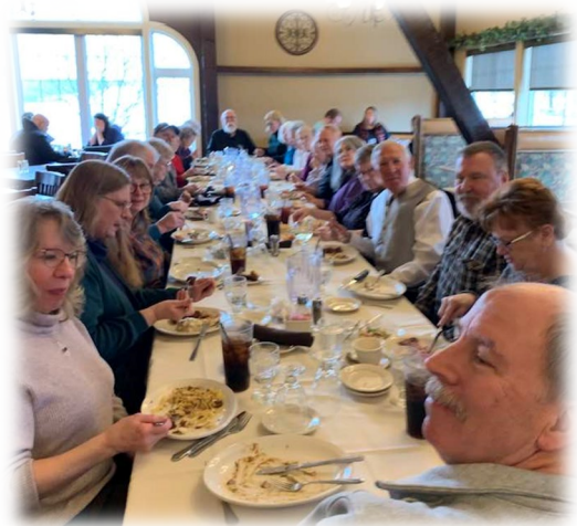
Sunday brunch at Cotton Exchange with all of Union Grove's Masonic bodies. A lot of fun and Fellowship.