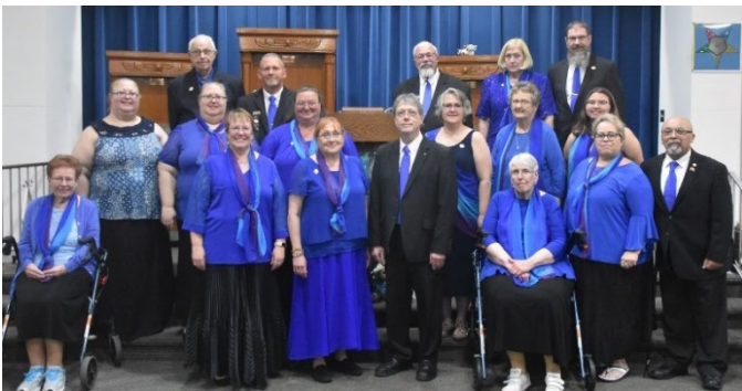
Vega Chapter, Milwaukee