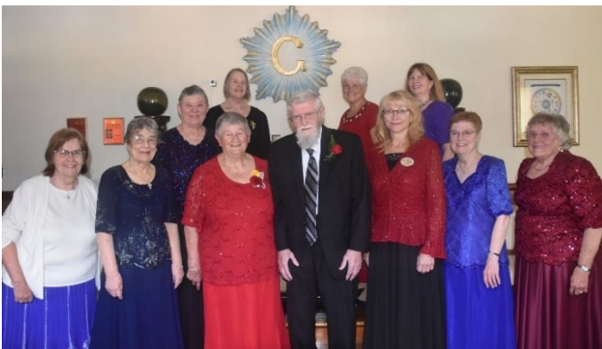
LaBelle Chapter, Mukwonago