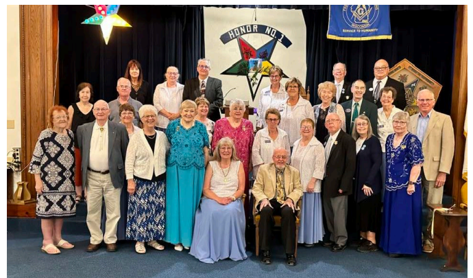
Honor Chapter, Sturgeon Bay