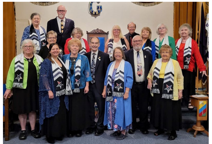
Ozaukee Chapter, Port Washington