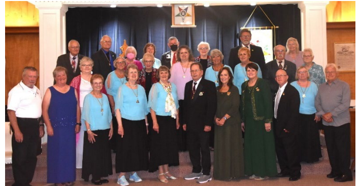
Oregon Chapter, Oregon