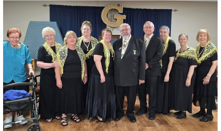
West Allis Chapter, West Allis