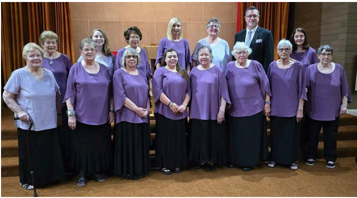
Wauwatosa Chapter, Brookfield