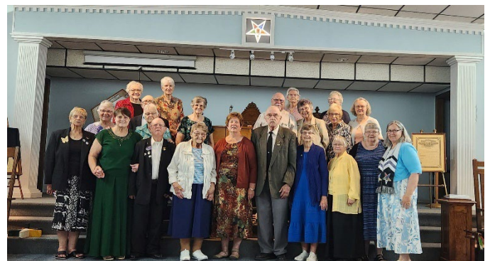
Lemonweir Chapter, Tomah