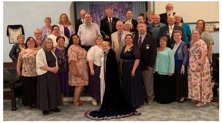
Bristol Chapter, Bristol