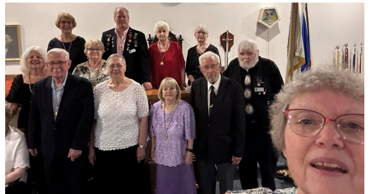
Everett Chapter, Marshfield