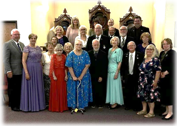
Fond du Lac #289