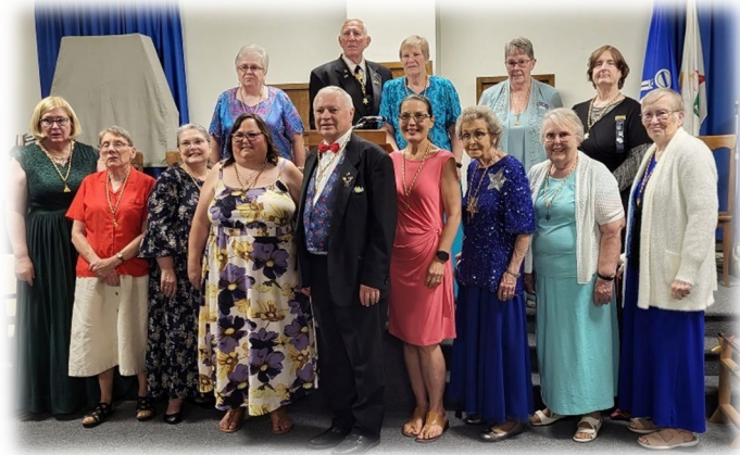
Union Grove #71